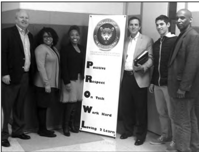
Orr Elementary School, designed by cox graae + spack

AIA | DC members may submit "Member News" items to newsletter@aiadc.com .