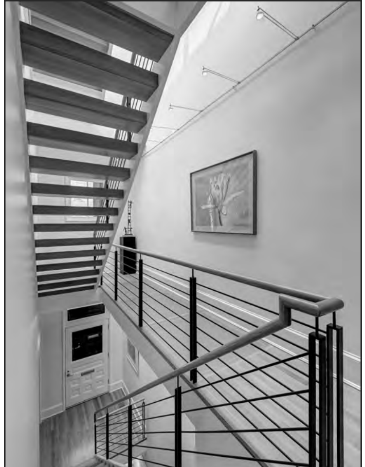
Muse Architects restoration of Kalorama rowhouse

Muse Architects recently received two design awards - the first a Montgomery County Planning Department Design Excellence Award for the LEED Certified Headquarters for Ruppert Nurseries in Laytonsville, MD. The project provided for the restoration and renovation of the historic Victorian farmhouse into offices as well as two new office buildings for staff about a courtyard beyond the historic house, all planned on a 2 1/2 acre parcel in order to preserve a tree farm. The second award was from the Potomac Valley AIA, for the complete restoration of an 1890's rowhouse in the Kalorama district of Washington, DC.