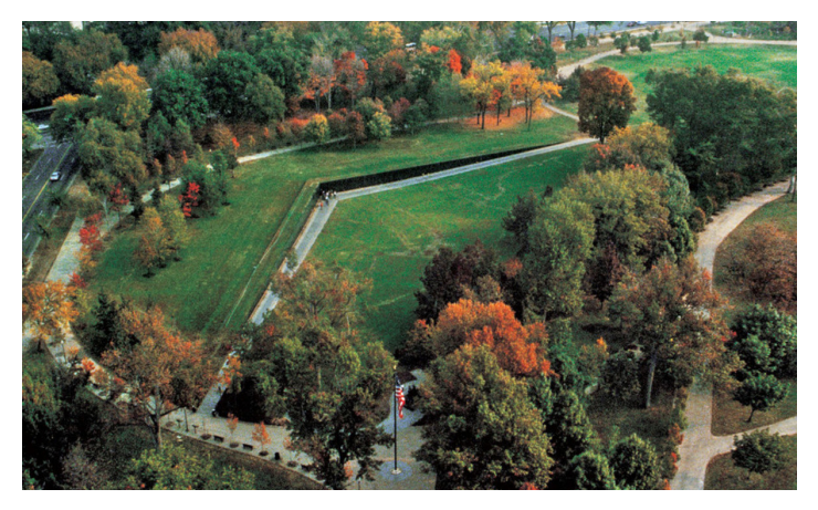
Vietnam War Veterans' Memorial Explore!