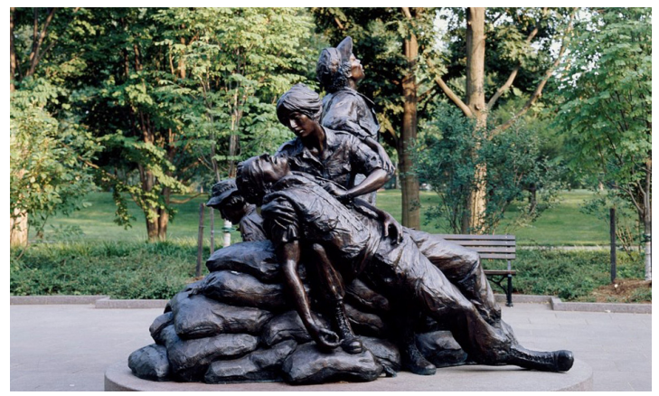
Vietnam War Women Veterans' Memorial Explore!