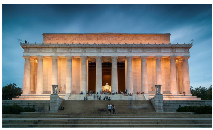
Lincoln Memorial Explore! Explore more!