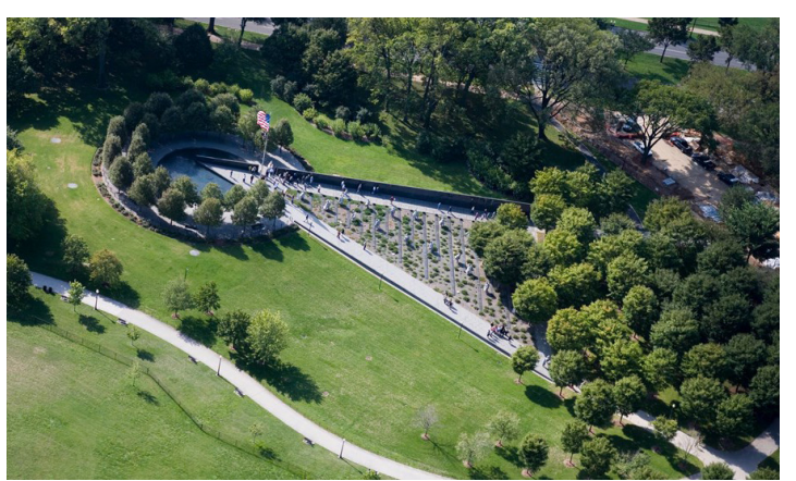
Korean War Veterans' Memorial Explore!