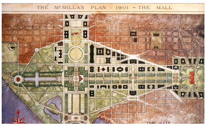
McMillan Plan L'Enfant Plan