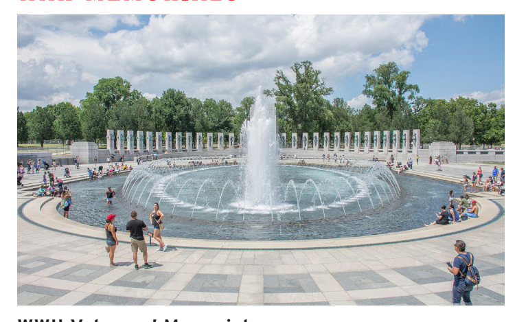
WWII Veterans' Memorial Explore!