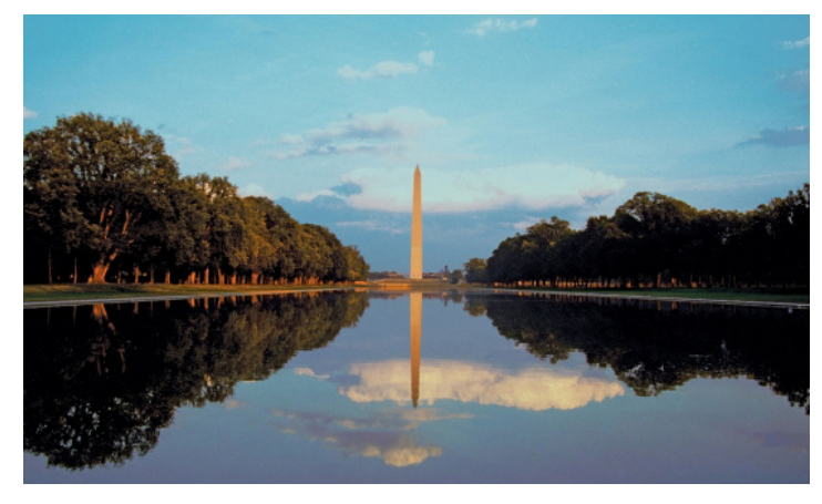
Reflecting Pool Explore!