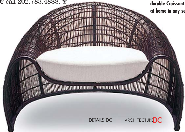
Below: The light and durable Croissant chair is at home in any setting.